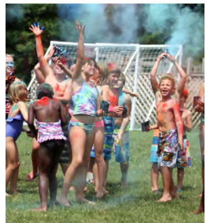
Campers coat each other with colorful powders during an activity at Camp Tanager last summer.

Thanks again to GreatAmerica Financial Services for their generous gift, which makes this project possible.