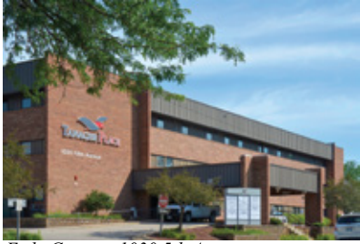
Estle Center - 1030 5th Ave