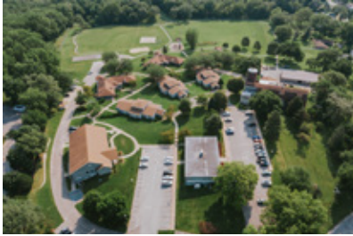
Main Campus - 2309 C St SW