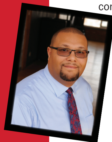
Okpara Rice CEO

So, consider this a snapshot of the amazing work our teams do each and every day. For 140 years we have been in this community hand-in-hand with you, meeting the needs of young people. We know there is tremendous work ahead and with your support and belief in our mission, we will continue to impact the lives of young people and help them find success.